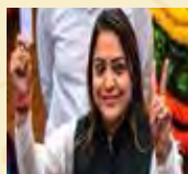
Hon'ble Shelly Oberoi Mayor of Delhi