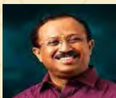
Hon'ble V Murleedharan Union Minister of State for External Affairs & Parliament Affairs, Govt of India