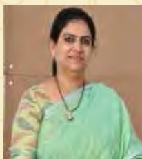
Hon'ble Hemaliben Boghawal Mayor of Surat