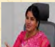
Hon'ble Rayana Bhagya Lakshmi Mayor of Vijayvada