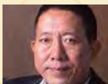
Hon'ble Lalrinea Sailo Mayor of Aizwal