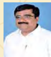
Hon'ble Gautam Sardana Mayor of Hissar