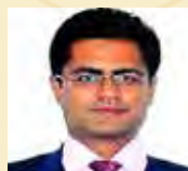
Shri Nitin Gaur City Commissioner Nagar Nigam, Ghaziabad