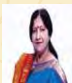
Hon'ble Sunita Dayal Mayor of Ghaziabad