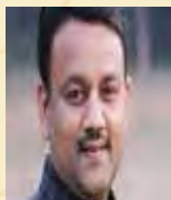
Hon'ble Gourave Goel Mayor of Roorkee