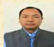
Shri Laremruta Kullai Joint Municipal Commissioner Aizwal