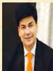
Hon'ble Dr Umesh Gautam Mayor of Barielly