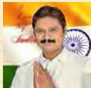
Hon'ble Jogendra Pal Singh Mayor of Haldwani