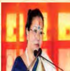
Hon'ble Nell Bahadur Chettri Mayor of Gangtok